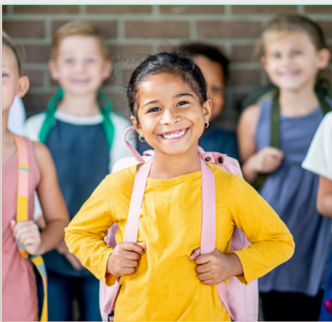
INSPIRING STUDENTS TO BE THE BEST THEY CAN BE

Parents have ongoing access to the PowerSchool grade book throughout the school year to view student progress and achievement in real-time.